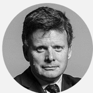
The Rt Hon Richard Benyon MP

The following document contains UKWP's response to 'Ofwat's emerging strategy: Driving transformational innovation in the sector ' document, published on 12 July 2019.